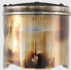
ECHO Power Blend @ 50:1