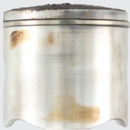
SABER Professional @ 100:1