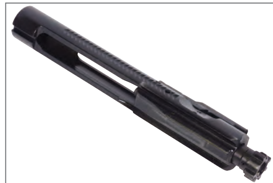
Synthetic Firearm Lubricant provided exceptional performance over rigorous range testing in multiple firearm applications.