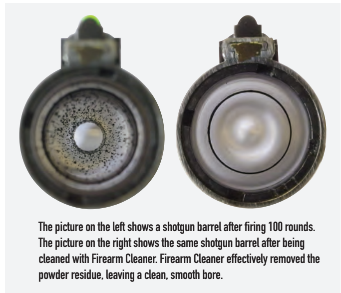
The picture on the left shows a shotgun barrel after firing 100 rounds. The picture on the right shows the same shotgun barrel after being cleaned with Firearm Cleaner. Firearm Cleaner effectively removed the powder residue, leaving a clean, smooth bore.

AMSOIL products are backed by a Limited Liability Warranty. For complete information visit AMSOIL.com/warranty.aspx .